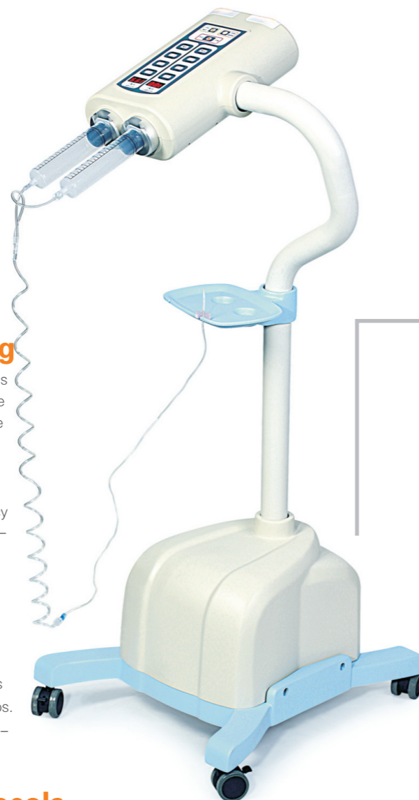
Injector Arm and Main Controller